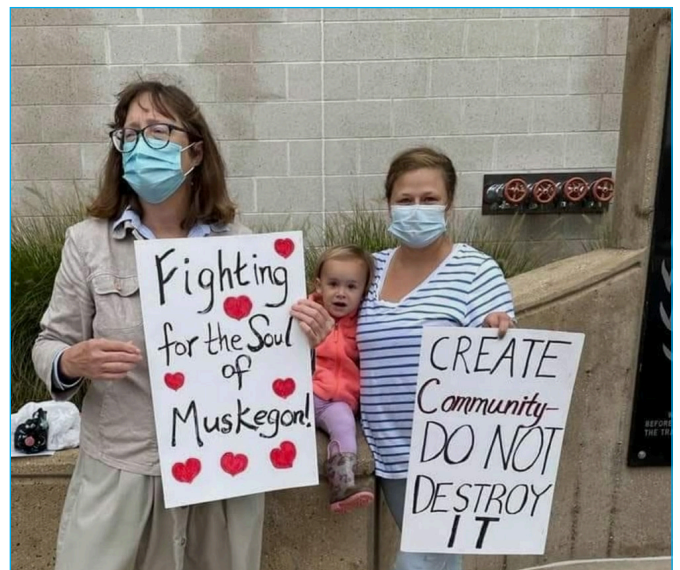
Taking it Back!

We hope to see you at a meeting in the future. Over the past few years we've seen this insidious Trump brand of hateful politics infiltrate our schools and municipal boardrooms. Their plan is to create division using fear and misinformation hidden behind a false guise of patriotism. Our plan is to stop them.